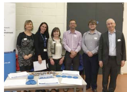
Apprenticeship Careers Fair at Sheffield Academy